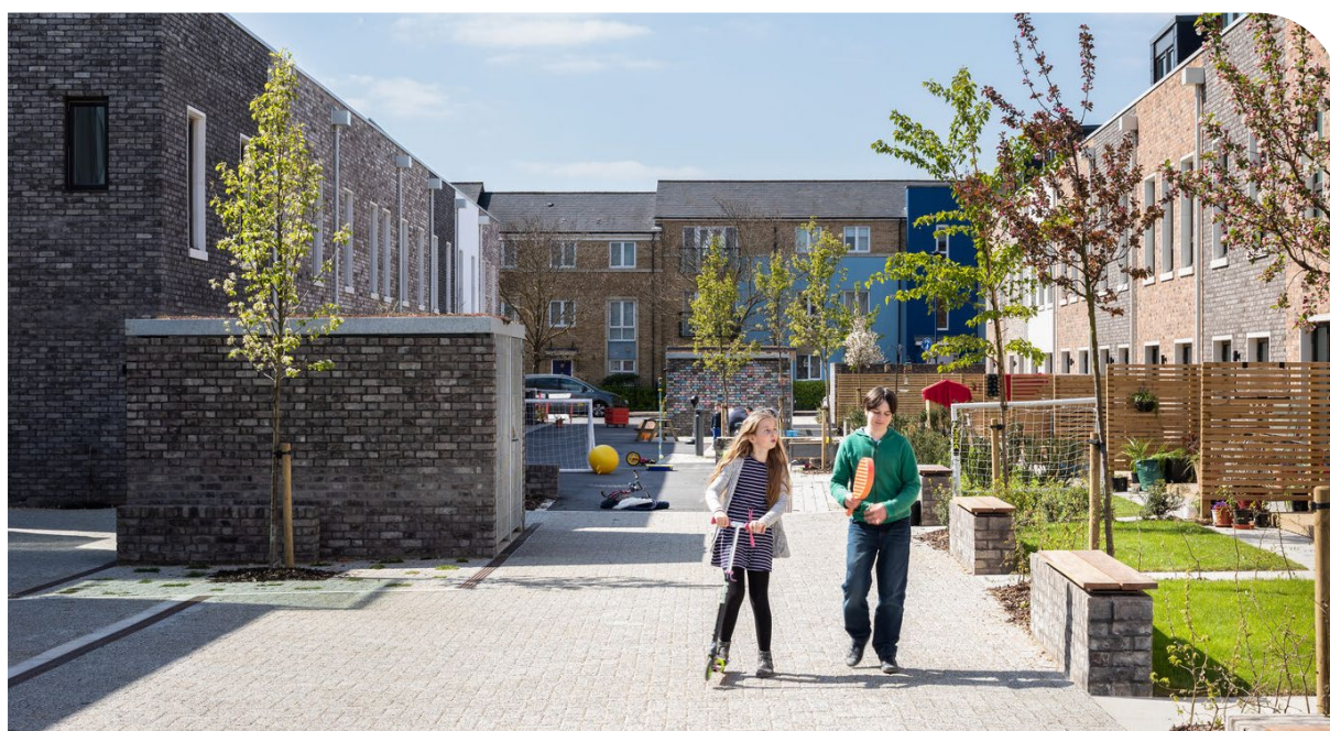
Marmalade Lane – Mole Architects

This report illustrates that well-designed built environment 'hardware' can go some way to encouraging people out into their local areas and to making it more likely they will encounter and interact with others. But our examples also show that sometimes planned interventions need to be combined with physical infrastructure to bring about the degree of social contact which is likely to be necessary for bringing about reductions in loneliness. Substantial funding will be needed